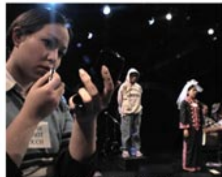
Isangmahal Arts Collective SEATTLE, WASHINGTON