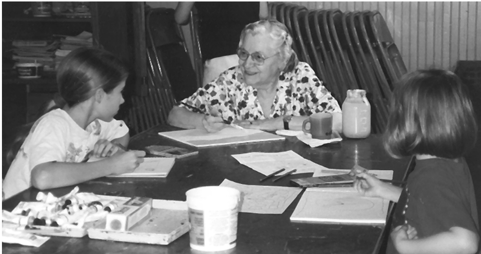
GRACE community workshop.