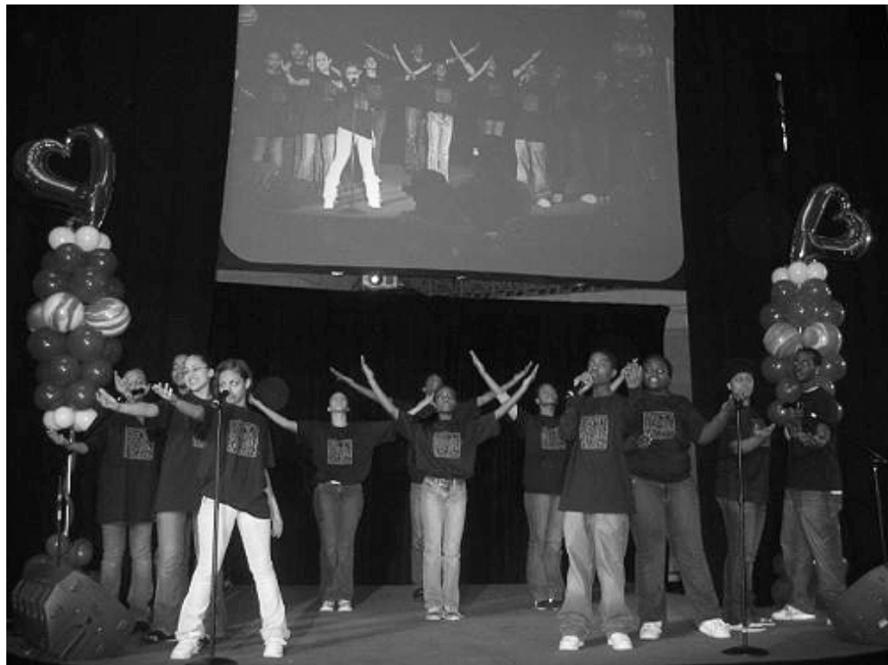
CityKids Rep Performing at Grand Central Station.