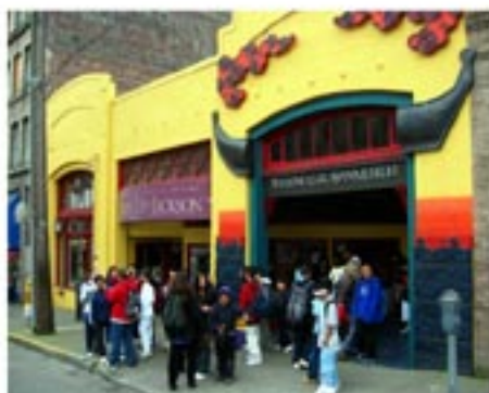
Wing Luke Asian Museum SEATTLE, WASHINGTON