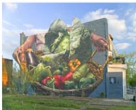
Mural Arts Program PHILADELPHIA, PENNSYLVANIA