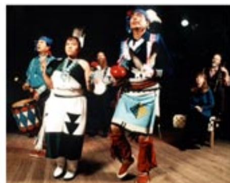
Zuni-Appalachian Exchange & Collaboration ZUNI PUEBLO, NEW MEXICO & WHITESBORO, KENTUCKY