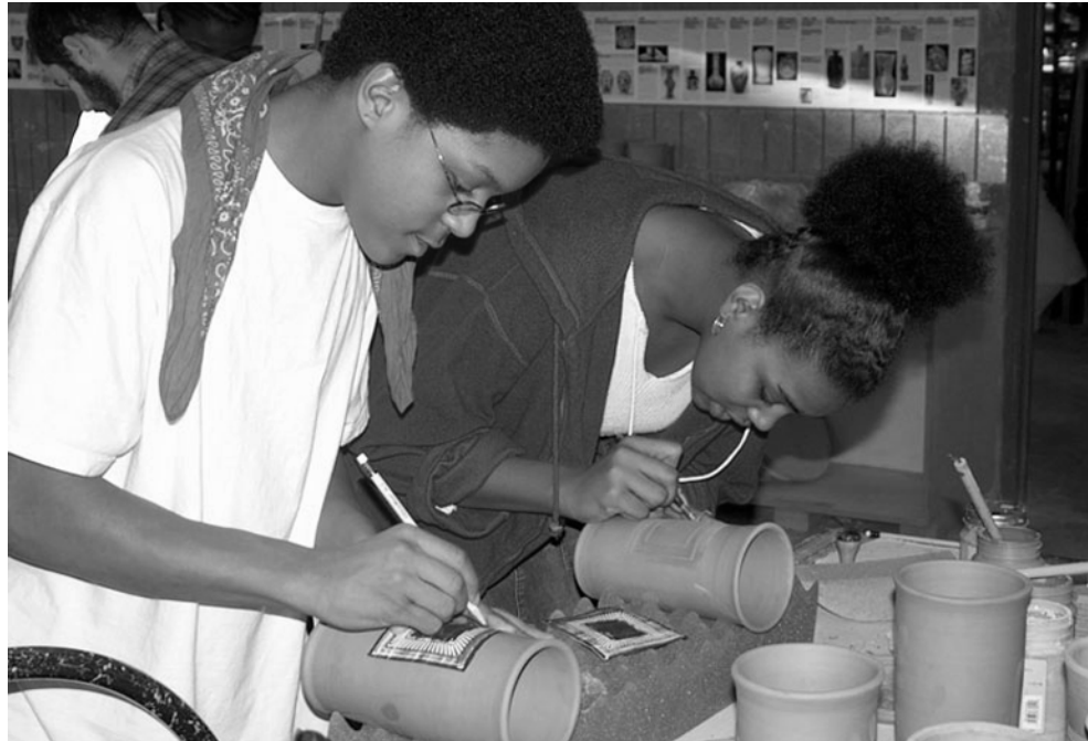
Manchester Craftsmen's Guild ceramics studio.