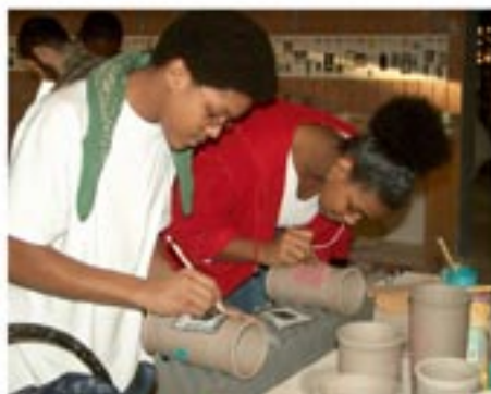
Manchester Craftsmen's Guild PITTSBURGH, PENNSYLVANIA