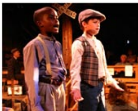
Swamp Gravy COKQUITT, GEORGIA