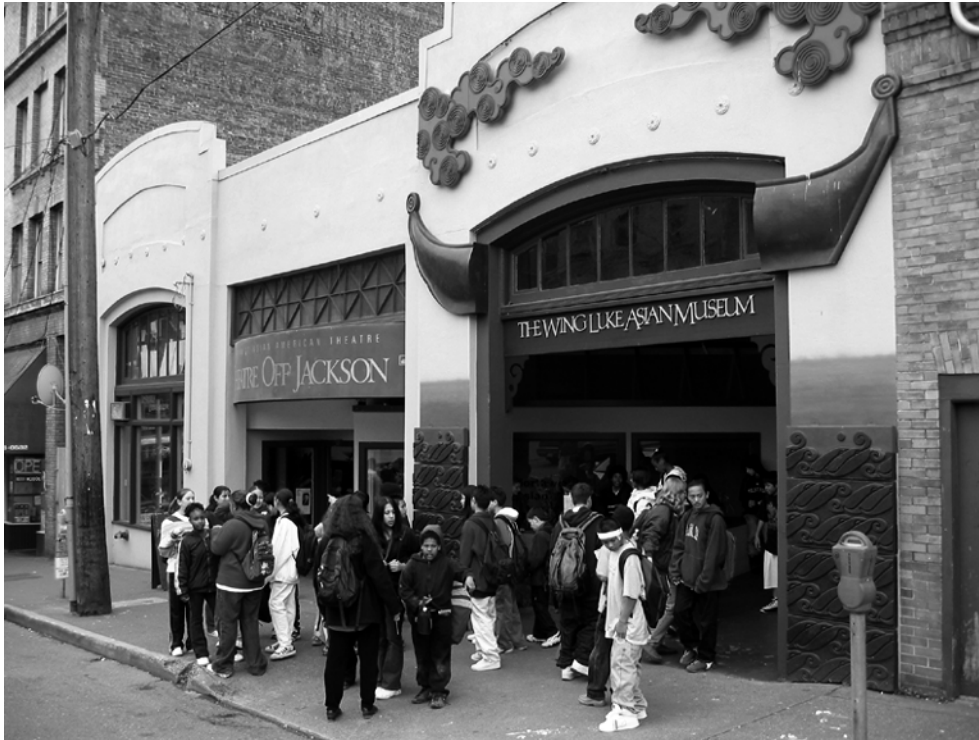
Current Wing Luke Asian Museum building in Seattle's International District.