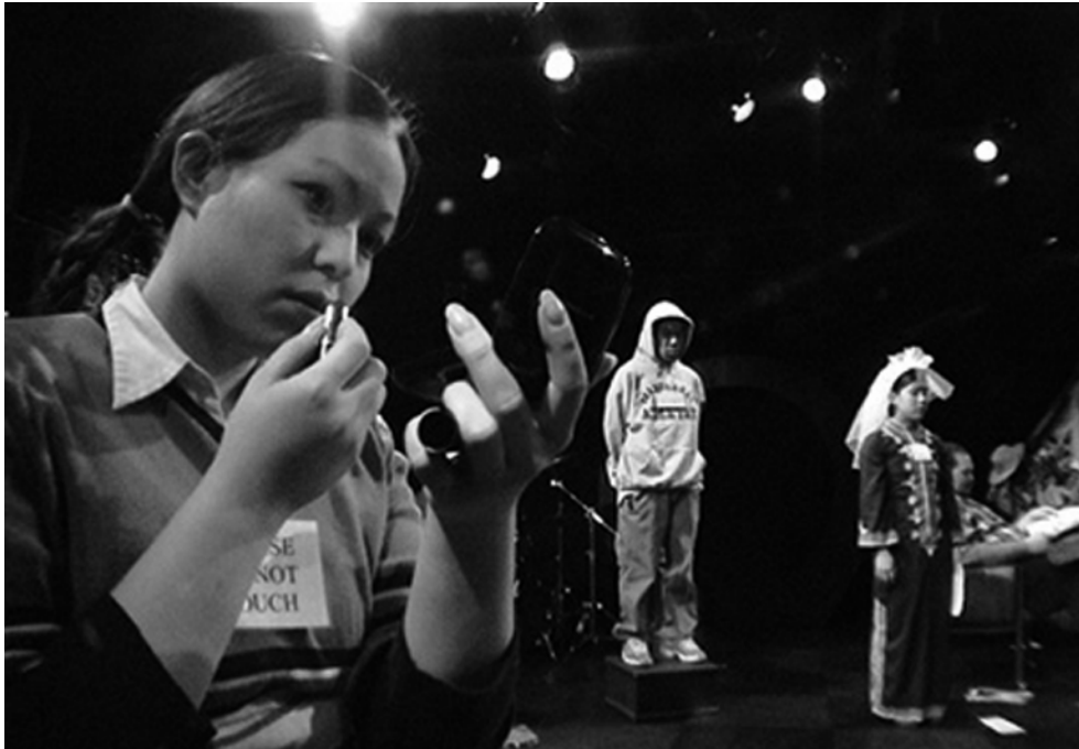
Isangmahal Arts Kollektive presents "Palengke," 2001.