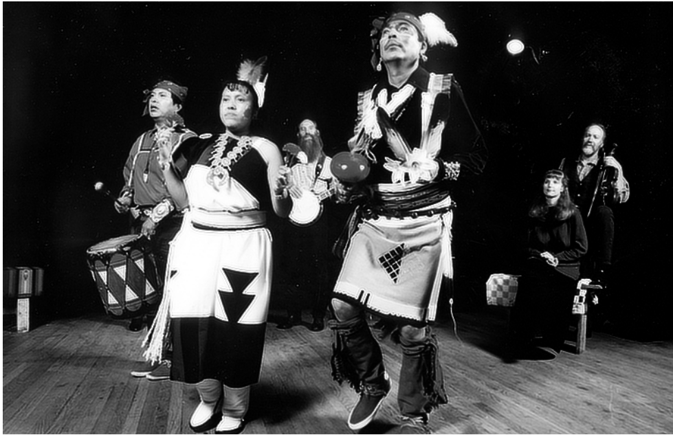
Roadside and Idiwanan An Chawe performing "Corn Mountain/Pine Mountain" (1994-6).