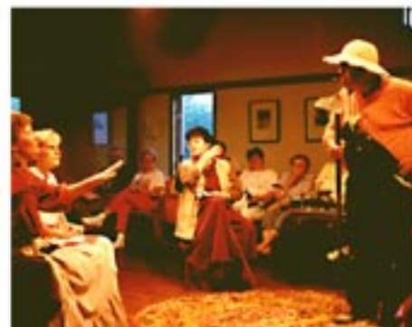
Northern Lakes Art Center AMERY, WISCONSIN