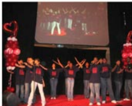
CityKids NEW YORK, NEW YORK

How U.S. arts-based programs have made a significant and sustained impact on their communities