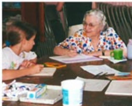
Grassroots Arts and Community Effort (GRACE) BANDWICK, VERMONT